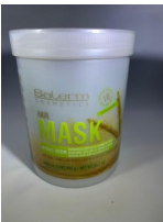
Salerm Hair Mask Wheat Germ Conditioning Treatment Hair Mask 33.7 Oz