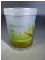
Salerm Hair Mask Wheat Germ Conditioning Treatment Hair Mask 33.7 Oz